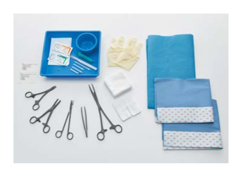
Thorax Drainage-Set, large