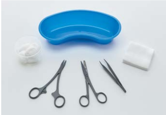
5061000 Suture Set 1