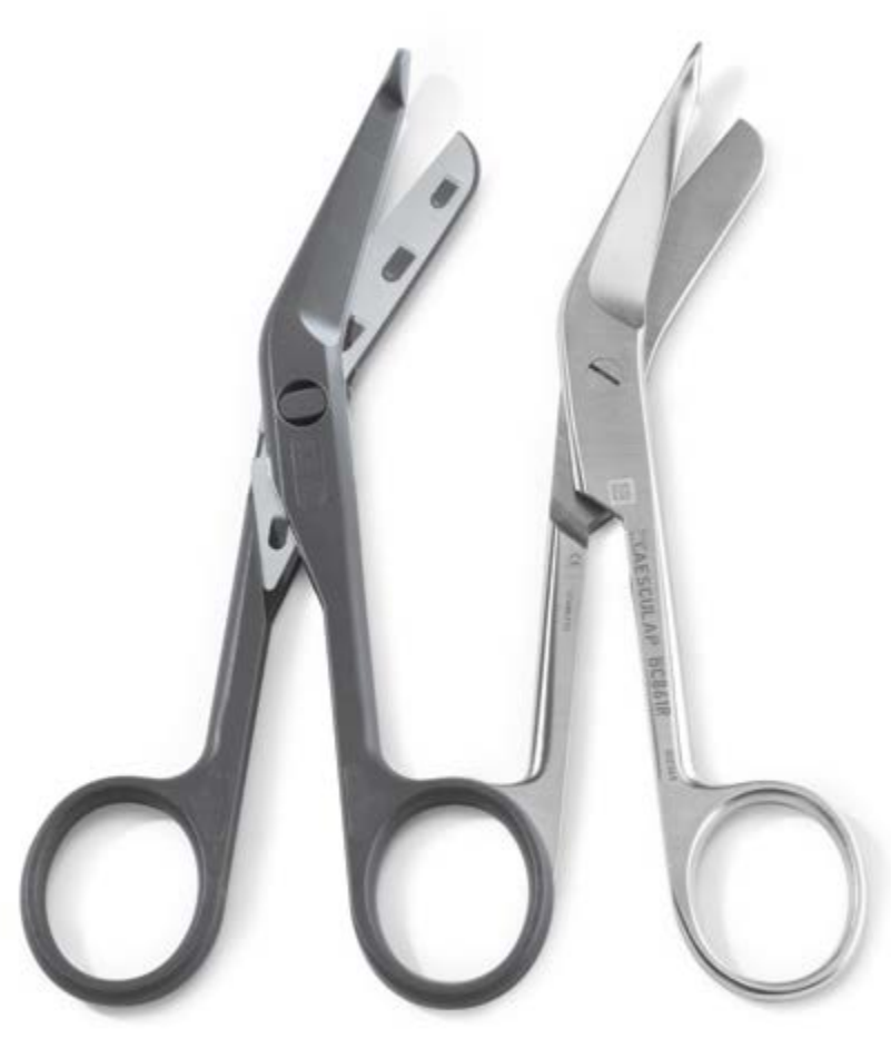
THINK QUALITY. THINK AESCULAP®.