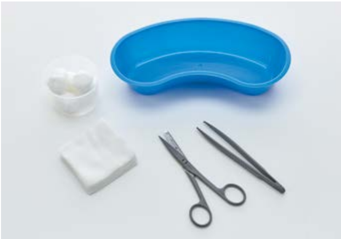
5061020 Surgical Dressing Set 2