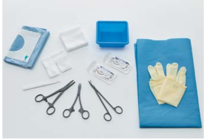
5061040 Suture Removal Set 1