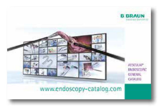
...just a click away!

All Aesculap endoscopy products on our Internet homepage: